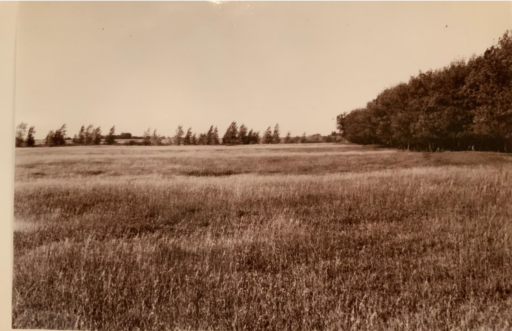
The Restoration of the Land the result of Frank Feser's soil conservation practices