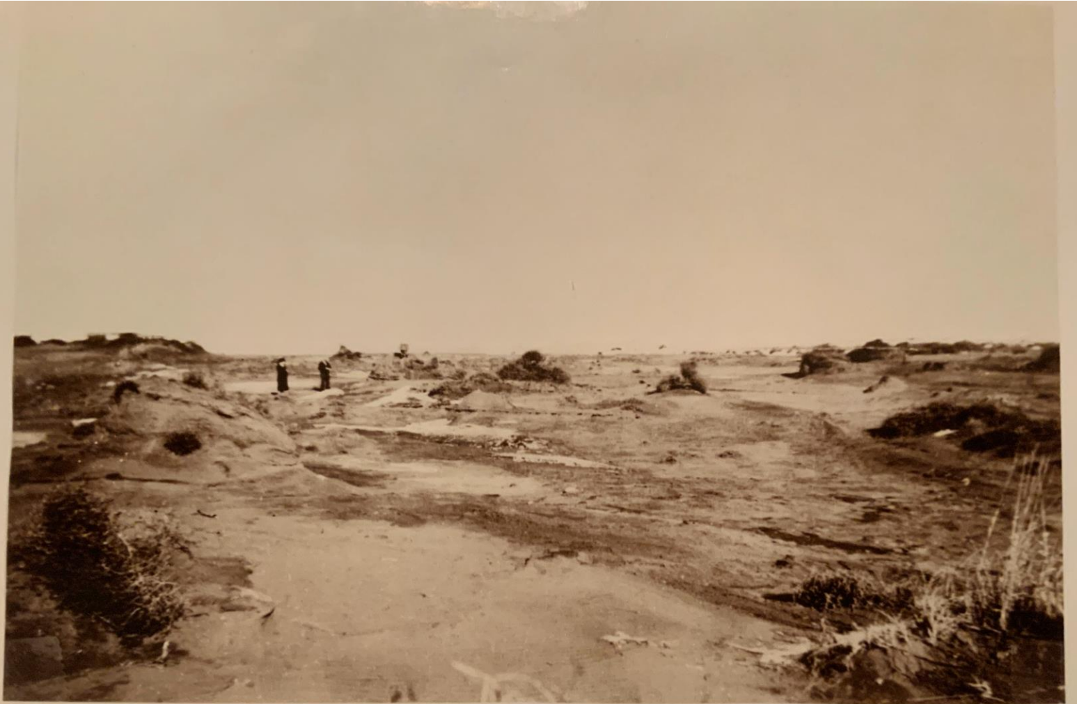
The Tragedy of the Thirties the land looked like sand dunes